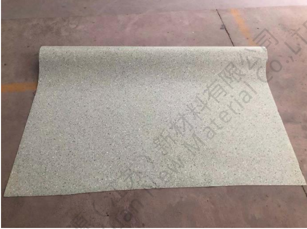
Front View(Test Face)